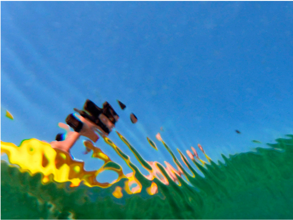
Figure 3. Cretan Sea supermarine 6288 © Rutherford.

with objectively defined criteria by which the word-processing software reconfigured the text.